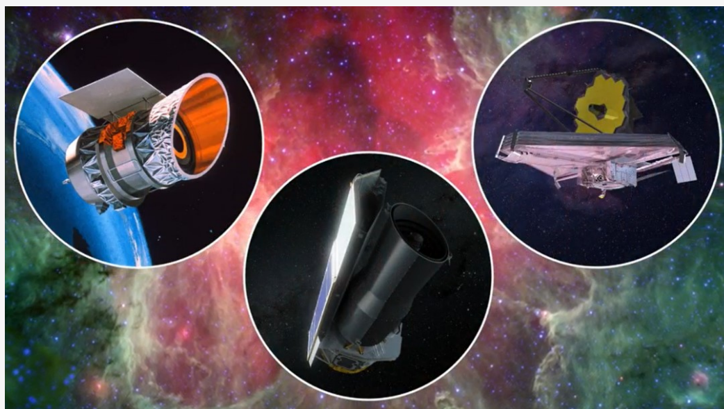
Scientists have been studying the universe with infrared space telescopes for 40 years, including these NASA missions, from left: the Infrared Astronomical Satellite (IRAS), launched in 1983; the Spitzer Space Telescope, launched in 2003; and the James Webb Space Telescope, launched in 2021.

"On Dec. 25, NASA will celebrate the two-year launch anniversary of the James Webb Space Telescope – the largest and most powerful space observatory in history. The clarity of its images has inspired the world, and scientists are just beginning to explore the scientific bounty it is returning.