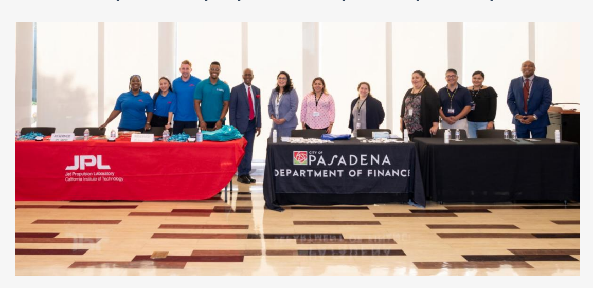
L to R: JPL Small Business Programs Office Team and the City of Pasadena Department of Finance Team